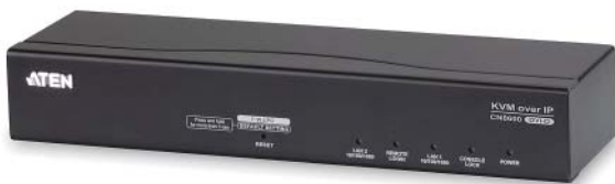
CN8600 Front view